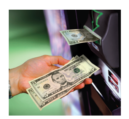
Accepts up to $20's, Pays out $1 or $5 bills