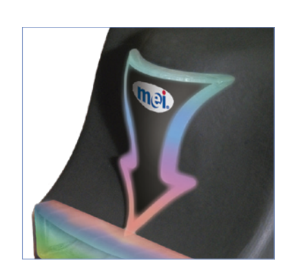
High-visibility bezel option strobes through a wide range of colors