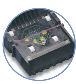
The fully encased, optical sensors ensure consistent, high-quality recognition, security and value.